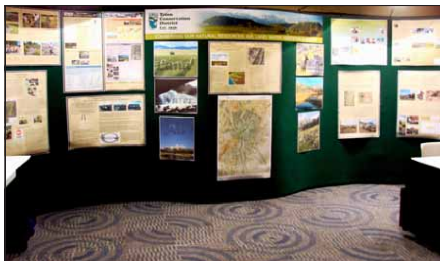
The Teton Conservation District displayed a portion of their projects and programs during the Conservation Expo.