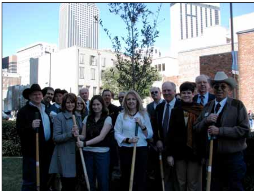
Wyoming representatives attended the Olin Sims Memorial tree planting held in conjunction with the NACD Annual Meeting.