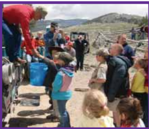
Dubois Crowheart CD annual Kids Fishing Day.

in partnership with the Wyoming Game & Fish and the US Forest Service as well as local volunteer groups. Kids have the opportunity to learn to fish and spend the afternoon trying out their newly acquired skills. Kids are taught fish identification, fish species identification, fly or spin casting, and a science based activity.