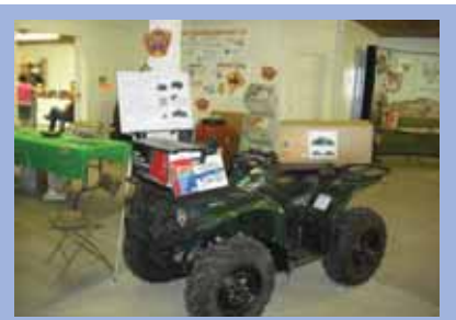
WNRF fundraising booth at State Fair.