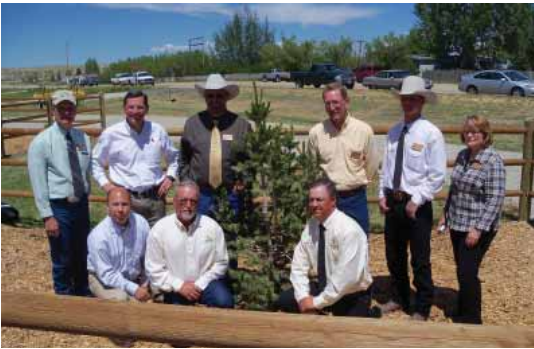
Photo: Senator John Barrasso with the Medicine Bow Conservation District board of supervisors and staff.